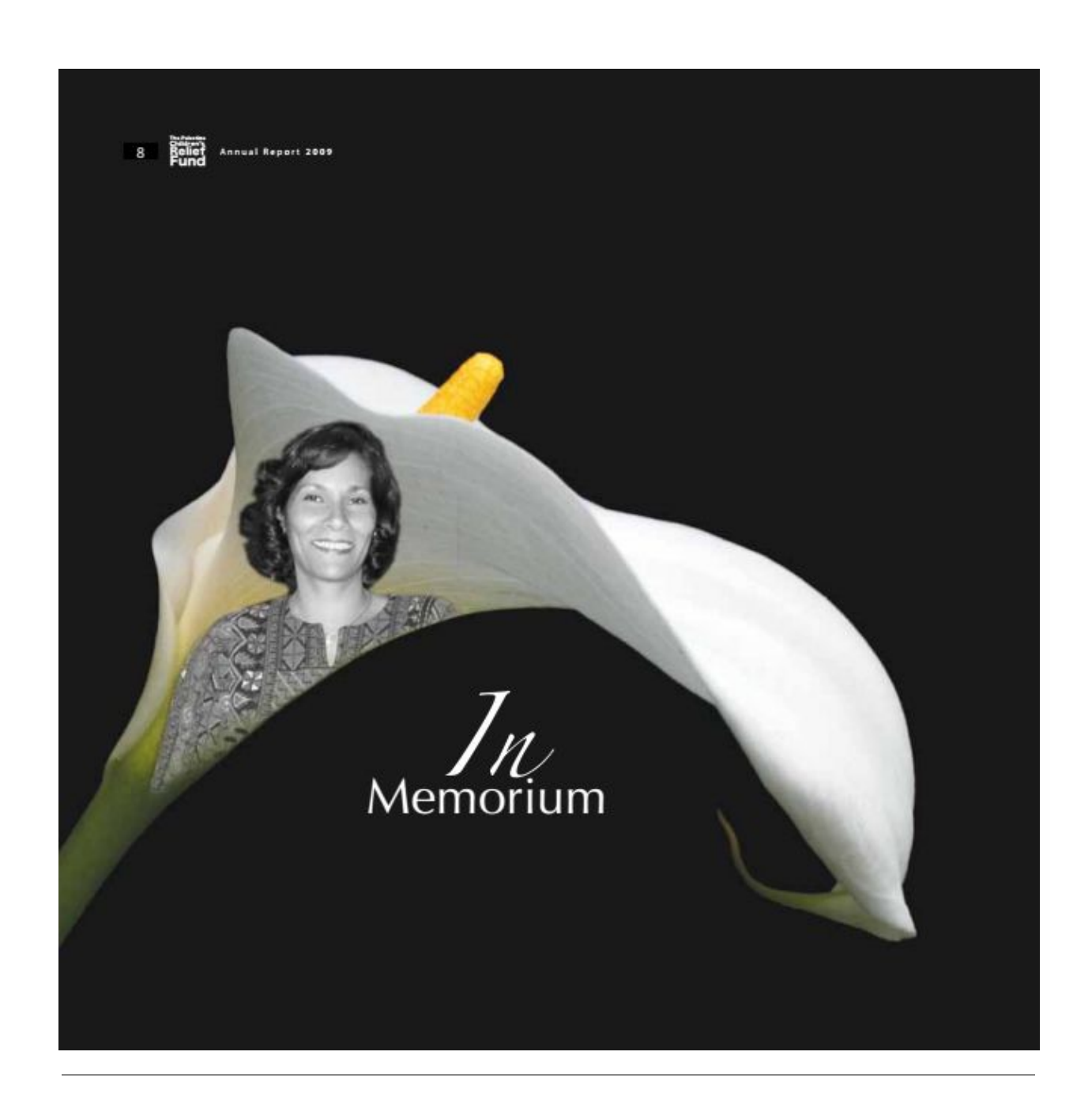
The The Children's Children's Relief Relief Fund Fund Palestine Palestine