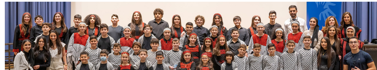
2022 Annual Chapter Event Fundraising Totals